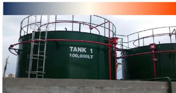
Fari island 100,000litr x2 tank