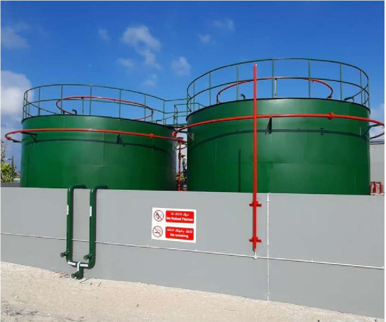
Fari island staff island tank 10,000litrs petrol tank