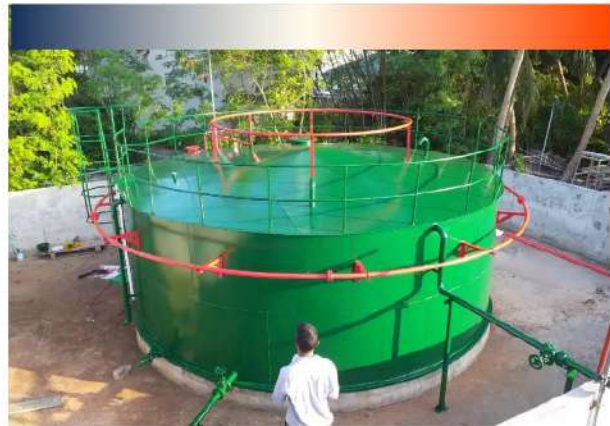
Madifushi island resort 100,000litrs tank