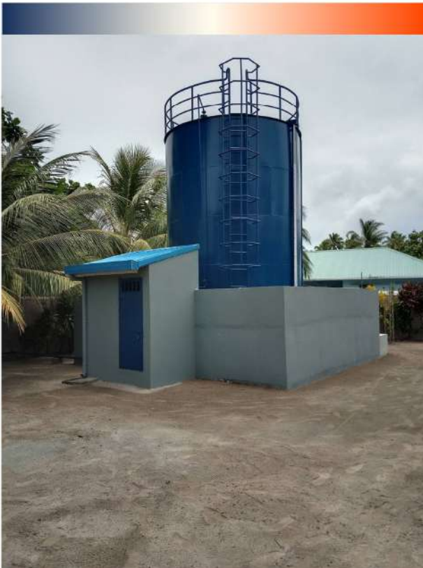
Magoodhoo fuel storage tank 60,000litrs